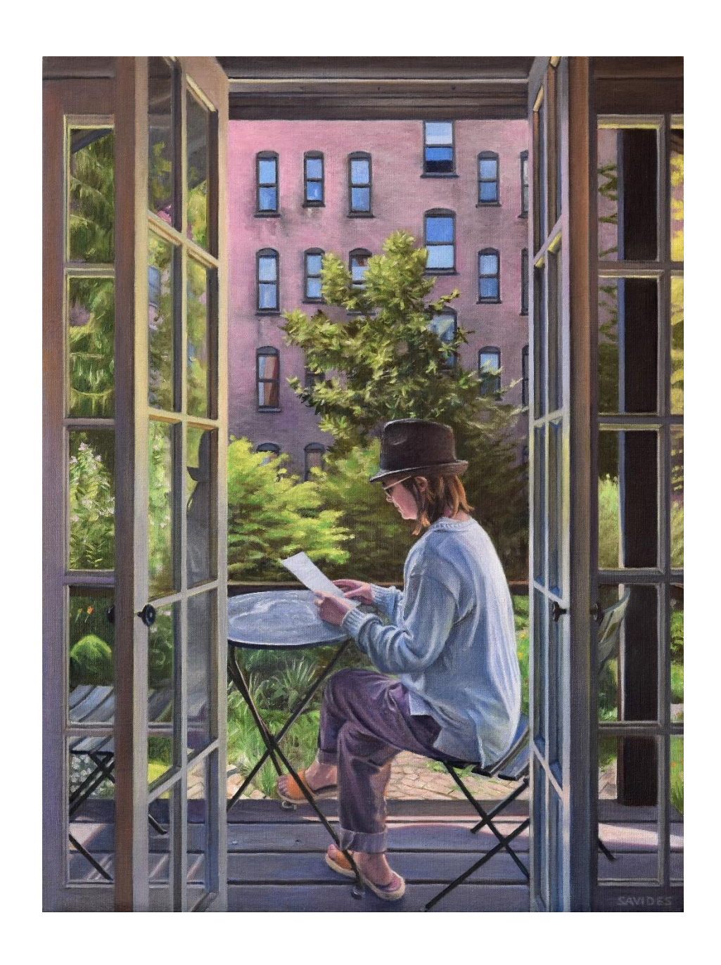
The Letter Oil on linen, 24" x 18", 2022